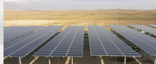
United Cable Industries Co. (UCIC)