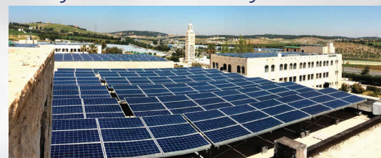
Al Zaytoonah University