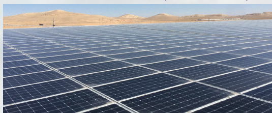
Giant Industrial Group (Al Emlaq)