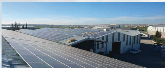
Jordan Tinplate & Canning Industry