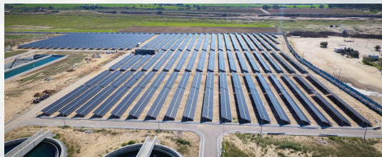
Gaza Central Wastewater Project