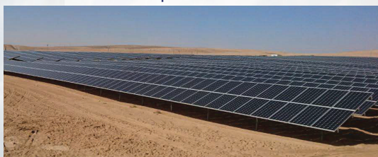
Al Istishari Hospital